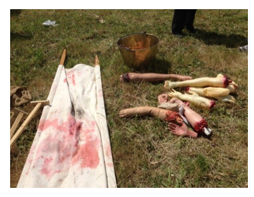
Artificial parts and blood from the medical tent

The Association works to demonstrate both military and civilian lives during this time in history. In addition to battle re-enactments there are medical demonstrations that show the terrible aftermath of the war.